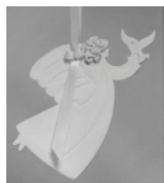
Angel #12 / Dove