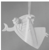
Angel #11 / Moon