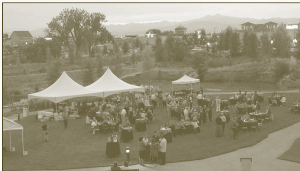
A Sunset Safari

A Sunset Safari, our August 29th fundraiser at Chapungu Sculpture Park in Loveland was tremendously successful, raising $9,300 for Bulawayo Island Hospice. We sincerely appreciate the efforts of A Sunset Safari planning committee and the participation of all 250 guests who shared a beautiful