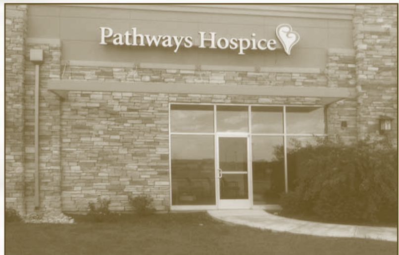
The New Windsor Office at 1580 Main Street.

YOU'RE INVITED TO A VINTAGE AFFAIR - A CLASSIC WINE TASTING